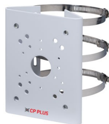
CP-UA-B3P Pole Mount